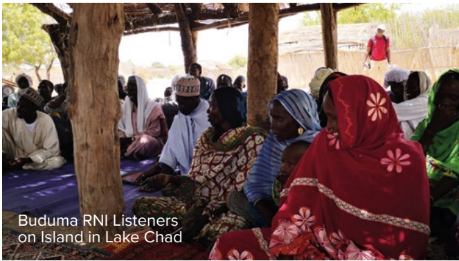
Buduma RNI Listeners on Island in Lake Chad

“Since the release of the RNI, there has been a big change in our community. We are in a village but divided into two different sub-prefectures. Thanks to these broadcasts, we are collaborating more and more..” A man from Djermaya