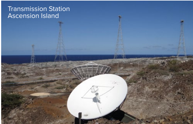
Transmission Station Ascension Island

The local language programming and trustworthy, relevant content allows people in the region to receive information from the world and has given a voice to those afflicted by violence.